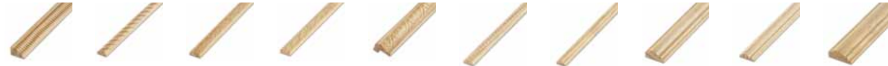
No. D-TM-1064EM 100414 3/4" X 1-1/4" X 8' 10 PCS/CTN Pine D-TM-106SEM 100415 5/16" X 11/16" X 8' 16 PCS/CTN Pine D-TM-1067EM 100416 3/4" X 3/4" X 8' 10 PCS/CTN Pine D-TM-1073EM 100418 5/16" X 3/4" X 8' 10 PCS/CTN Pine No. D-TM-E7760EM 100445 3/4" X 1-3/16" X 8' 60 PCS/CTN Pine No. D-TM-L58EM 100486 7/32" X 17/32" X 8' 25 PCS/CTN Pine No. D-TM-L58 100485 7/32" X 17/32" X 8' 25 PCS/CTN Pine No. D-TM-A9 100422 9/16" X 1-3/16" X 8' 25 PCS/CTN Pine No. D-TM-D7 100441 5/16" X 7/8" X 8' 25 PCS/CTN Pine No. D-TM-R42 100596 11/16" X 1-3/4" X 8' 10 PCS/CTN Pine