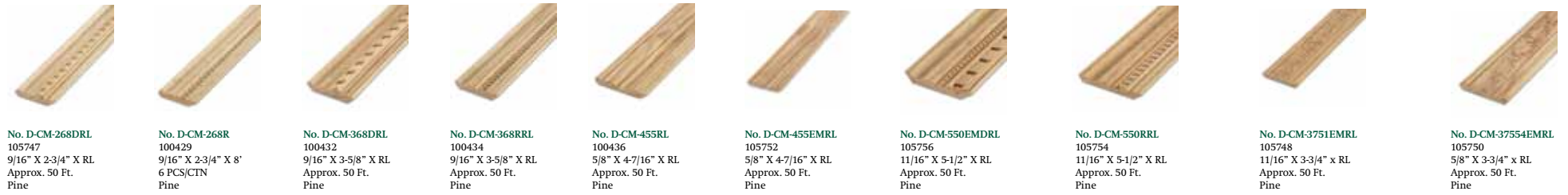
No. D-CM-268DRL 105747 9/16" X 2-3/4" X 8' Approx. 50 Ft. Pine No. D-CM-268R 100429 9/16" X 2-3/4" X 8' 6 PCS/CTN Pine No. D-CM-368DRL 100432 9/16" X 3-5/8" X 8' Approx. 50 Ft. Pine No. D-CM-368RRL 100434 9/16" X 3-5/8" X 8' Approx. 50 Ft. Pine No. D-CM-455RL 100436 5/8" X 4-7/16" X 8' Approx. 50 Ft. Pine No. D-CM-455EMRL 105752 5/8" X 4-7/16" X 8' Approx. 50 Ft. Pine No. D-CM-550EMDRL 105756 11/16" X 5-1/2" X 8' Approx. 50 Ft. Pine No. D-CM-550RRL 105754 11/16" X 5-1/2" X 8' Approx. 50 Ft. Pine No. D-CM-3751EMRL 105748 11/16" X 3-3/4" X 8' Approx. 50 Ft. Pine No. D-CM-37554EMRL 105750 5/8" X 3-3/4" X 8' Approx. 50 Ft. Pine