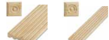
No. D-FLC-75T 100451 1/2" X 3-1/8" X 7' 4 SETS/CTN Pine No. D-FLC-2255T 100447 1/2" X 2-1/4" X 7' 12 SETS/CTN Pine