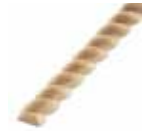
No. D-ROPE4 100600 3/8" X 3/4" X 8' 12 PCS/CTN Pine