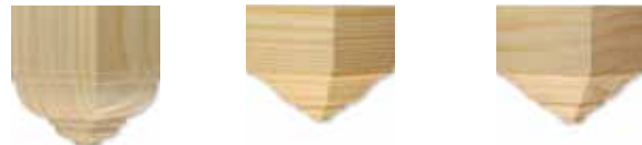
No. D-OCCB-250 100557 3-1/2" X 3-1/2" X 4-1/2" 4 PCS/CTN Pine Fits Moulding up to: 3-1/8" No. D-OCCB-275 105753 5-9/16" X 5-9/16" X 5-11/16" 2 PCS/CTN Pine Fits Moulding up to: 4" No. D-OCCB-358 105755 7-11/32" X 7-11/32" X 7-1/2" 2 PCS/CTN Pine Fits Moulding up to: 5-1/2"