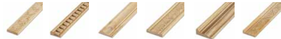
No. D-CR-2054EM 100419 9/16" X 2" X 8' 6 PCS/CTN Pine No. D-CR-212DRL 105758 7/8" X 2-1/8" X 8' Approx. 50 Ft. Pine No. D-CR-268EMRRL 105759 3/4" X 2-3/4" X 8' Approx. 50 Ft. Pine No. D-CR-2010EMRL 105744 5/8" X 3-1/8" X 8' Approx. 50 Ft. Pine No. D-CR-300EMRL 105760 1-1/16" X 2-15/16" X 8' Approx. 50 Ft. Pine No. D-CR-21290EMRL 105757 7/8" X 2-1/8" X 8' Approx. 50 Ft. Pine