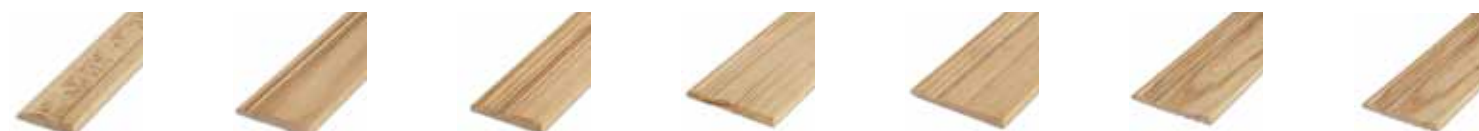
No. D-BB-1054EM 100412 5/8" X 3-1/8" X 8' 6 PCS/CTN Pine No. D-BB-550EMRRL 105741 11/16" X 4-15/16" X 8' Approx. 50 Ft. Pine No. D-BB-400EMRL 105742 11/16" X 3-15/16" X 8' Approx. 50 Ft. Pine No. D-BB-650RL 100423 11/16" X 6-5/8" X 8' Approx. 50 Ft. Pine No. D-BB-650EMRRL 105786 11/16" X 6-5/8" X 8' Approx. 50 Ft. Pine No. D-BB-650EMRL 105736 11/16" X 6-5/8" X 8' Approx. 50 Ft. Pine No. D-BB-2010EMRL 105737 5/8" X 3-1/8" X 8' Approx. 50 Ft. Pine