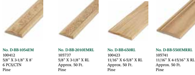
No. D-BB-1054EM 100412 5/8" X 3-1/8" X 8" 6 PCS/CTN Pine No. D-BB-2010EMRL 105737 5/8" X 3-1/8" X RL Approx. 50 Ft. Pine No. D-BB-650RL 100423 11/16" X 6-5/8" X RL Approx. 50 Ft. Pine No. D-BB-550EMRRL 105741 11/16" X 4-15/16" X RL Approx. 50 Ft. Pine