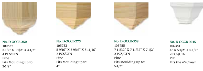
No. D-OCCB-250 100557 3-1/2" X 3-1/2" X 4-1/2" 4 PCS/CTN Pine Fits Moulding up to: 3-1/8" No. D-OCCB-275 100553 5-9/16" X 5-9/16" X 5-11/16" 2 PCS/CTN Pine Fits Moulding up to: 4" No. D-OCCB-358 105755 7-11/32" X 7-11/32" X 7-1/2" 2 PCS/CTN Pine Fits Moulding up to: 5-1/2" No. D-OCCB-0045 106381 4" X 5-1/2" X 5-1/2" 2 PCS/CTN PPF Fits the 45 Crown