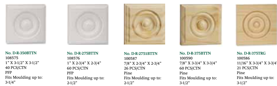
No. D-R-350BTIN 108575 1" X 3-1/2" X 3-1/2" 40 PCS/CTN PPF Fits Moulding up to: 3-1/4" No. D-R-275BTIN 108576 1" X 2-3/4" X 2-3/4" 60 PCS/CTN PPF Fits Moulding up to: 2-1/2" No. D-R-2751BTIN 100587 7/8" X 2-3/4" X 2-3/4" 26 PCS/CTN Pine Fits Moulding up to: 2-1/2" No. D-R-375BTIN 100590 7/8" X 3-3/4" X 3-3/4" 60 PCS/CTN Pine Fits Moulding up to: 3-1/2" No. D-R-375TRG 100586 11/16" X 3-3/4" X 3-3/4" 21 PCS/CTN Pine Fits Moulding up to: 3-1/2"