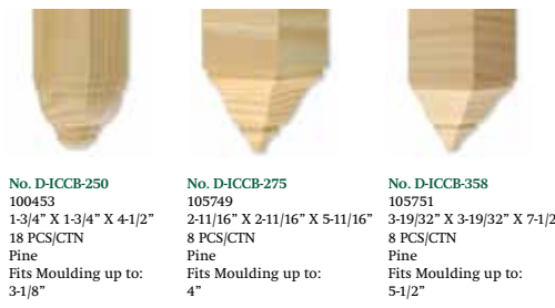
No. D-ICCB-250 100453 1-3/4" X 1-3/4" X 4-1/2" 18 PCS/CTN Pine Fits Moulding up to: 3-1/8" No. D-ICCB-275 105749 2-11/16" X 2-11/16" X 5-11/16" 8 PCS/CTN Pine Fits Moulding up to: 4" No. D-ICCB-358 105751 3-19/32" X 3-19/32" X 7-1/2" 8 PCS/CTN Pine Fits Moulding up to: 5-1/2"