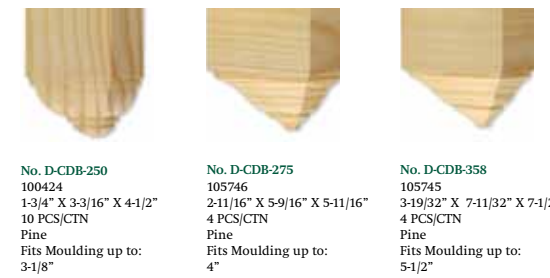
No. D-CDB-250 100424 1-3/4" X 3-3/16" X 4-1/2" 10 PCS/CTN Pine Fits Moulding up to: 3-1/8" No. D-CDB-275 105746 2-11/16" X 5-9/16" X 5-11/16" 4 PCS/CTN Pine Fits Moulding up to: 4" No. D-CDB-358 105745 3-19/32" X 7-11/32" X 7-1/2" 4 PCS/CTN Pine Fits Moulding up to: 5-1/2"