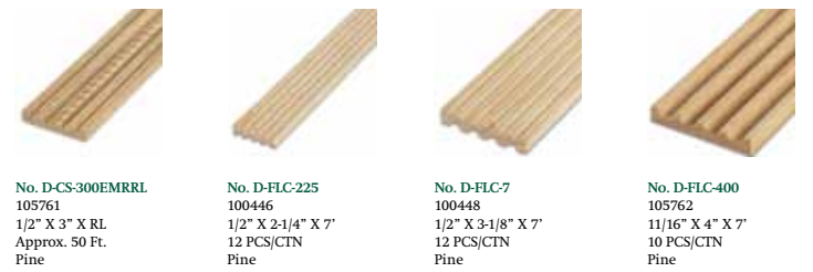
No. D-CS-300EMRRL 105761 1/2" X 3" X RL Approx. 50 Ft. Pine No. D-FLC-225 100446 1/2" X 2-1/4" X 7" 12 PCS/CTN Pine No. D-FLC-7 100448 1/2" X 3-1/8" X 7" 10 PCS/CTN Pine No. D-FLC-400 105762 11/16" X 4" X 7" 10 PCS/CTN Pine