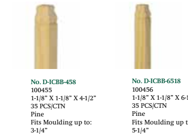
No. D-ICBB-458 100455 1-1/8" X 1-1/8" X 4-1/2" 35 PCS/CTN Pine Fits Moulding up to: 3-1/4" No. D-ICBB-6518 100456 1-1/8" X 1-1/8" X 6-1/2" 35 PCS/CTN Pine Fits Moulding up to: 5-1/4"