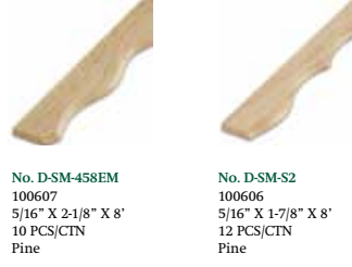
No. D-SM-458EM 100607 5/16" X 2-1/8" X 8" 10 PCS/CTN Pine No. D-SM-S2 100606 5/16" X 1-7/8" X 8" 12 PCS/CTN Pine