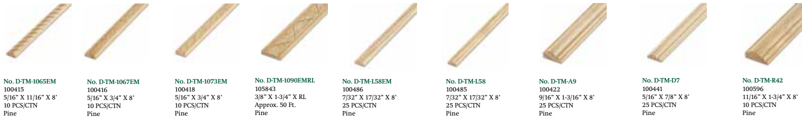
No. D-TM-1065EM 100415 5/16" X 11/16" X 8" 10 PCS/CTN Pine No. D-TM-1067EM 100416 5/16" X 3/4" X 8" 10 PCS/CTN Pine No. D-TM-1073EM 100418 5/16" X 3/4" X 8" 10 PCS/CTN Pine No. D-TM-1090EMRL 105843 3/8" X 1-3/4" X RL Approx. 50 Ft. Pine No. D-TM-L58EM 100486 7/32" X 17/32" X 8" 25 PCS/CTN Pine No. D-TM-L58 100485 7/32" X 17/32" X 8" 25 PCS/CTN Pine No. D-TM-A9 100422 9/16" X 1-3/16" X 8" 25 PCS/CTN Pine No. D-TM-D7 100441 5/16" X 7/8" X 8" 25 PCS/CTN Pine No. D-TM-R42 100596 11/16" X 1-3/4" X 8" 10 PCS/CTN Pine No. D-ROPE4 100600 3/8" X 3/4" X 8" 12 PCS/CTN Pine