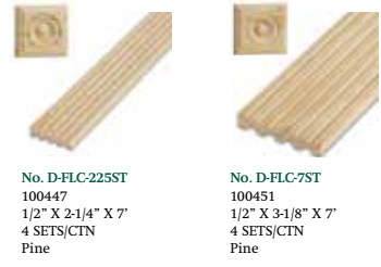
No. D-FLC-225ST 100447 1/2" X 2-1/4" X 7" 4 SETS/CTN Pine No. D-FLC-7ST 100451 1/2" X 3-1/8" X 7" 4 SETS/CTN Pine