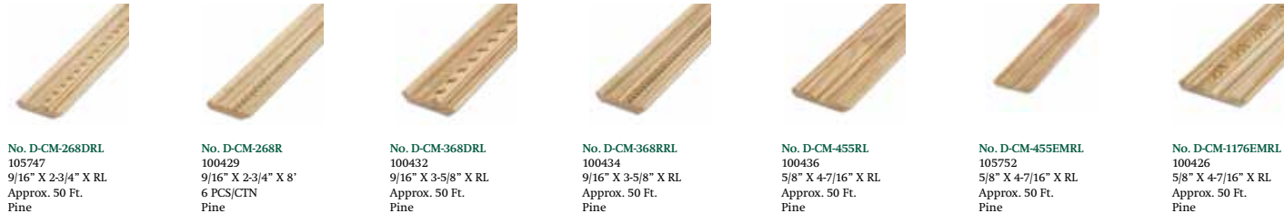
No. D-CM-268DRL 105747 9/16" X 2-3/4" X RL Approx. 50 Ft. Pine No. D-CM-268R 100429 9/16" X 2-3/4" X 8" 6 PCS/CTN Pine No. D-CM-368DRL 100432 9/16" X 3-5/8" X RL Approx. 50 Ft. Pine No. D-CM-368RRL 100434 9/16" X 3-5/8" X RL Approx. 50 Ft. Pine No. D-CM-455RL 100436 5/8" X 4-7/16" X RL Approx. 50 Ft. Pine No. D-CM-455EMRL 105752 5/8" X 4-7/16" X RL Approx. 50 Ft. Pine No. D-CM-1176EMRL 100426 5/8" X 4-7/16" X RL Approx. 50 Ft. Pine