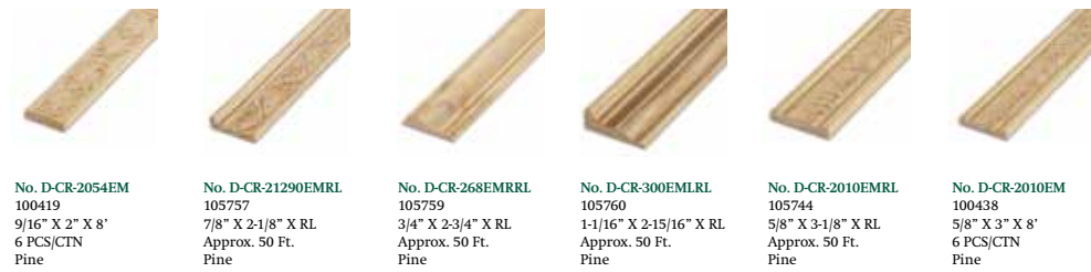
No. D-CR-2054EM 100419 9/16" X 2" X 8" 6 PCS/CTN Pine No. D-CR-21290EMRL 105757 7/8" X 2-1/8" X RL Approx. 50 Ft. Pine No. D-CR-268EMRRL 105759 3/4" X 2-3/4" X RL Approx. 50 Ft. Pine No. D-CR-300EMRL 105760 1-1/16" X 2-15/16" X RL Approx. 50 Ft. Pine No. D-CR-2010EMRL 105744 5/8" X 3-1/8" X RL Approx. 50 Ft. Pine No. D-CR-2010EM 100438 5/8" X 3" X 8" 6 PCS/CTN Pine