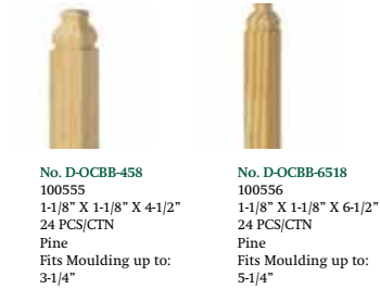
No. D-OCBB-458 100555 1-1/8" X 1-1/8" X 4-1/2" 24 PCS/CTN Pine Fits Moulding up to: 3-1/4" No. D-OCBB-6518 100556 1-1/8" X 1-1/8" X 6-1/2" 24 PCS/CTN Pine Fits Moulding up to: 5-1/4"