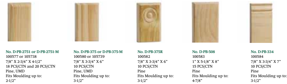
No. D-PB-2751 or D-PB-2751-M 100577 or 105738 7/8" X 2-3/4" X 4-1/2" 18 PCS/CTN and 20 PCS/CTN Pine, UMD Fits Moulding up to: 2-1/2" No. D-PB-375 or D-PB-375-M 100580 or 105739 7/8" X 3-3/4" X 6" 10 PCS/CTN Pine, UMD Fits Moulding up to: 3-1/2" No. D-PB-375R 100582 7/8" X 3-3/4" X 6" 10 PCS/CTN Pine Fits Moulding up to: 3-1/2" No. D-PB-508 100583 1" X 5-1/8" X 8" 15 PCS/CTN Pine Fits Moulding up to: 4-7/8" No. D-PB-334 100584 7/8" X 3-3/4" X 7" 10 PCS/CTN Pine Fits Moulding up to: 3-1/2"